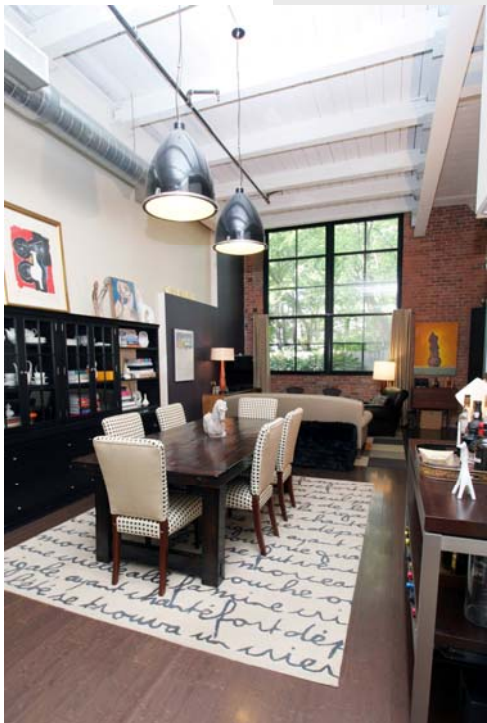
Exquisite Décor & Interior Design