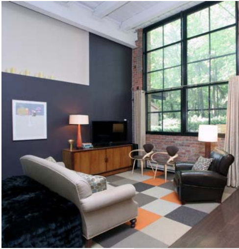
Soaring Ceiling Height Approx. 15'