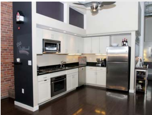
Black Raven Granite & Bamboo Floor