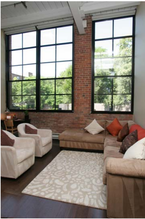
Soaring Ceiling Height Approx. 15'