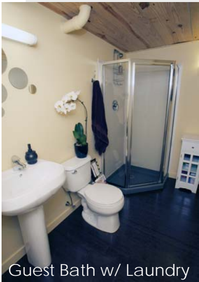
Guest Bath w/ Laundry