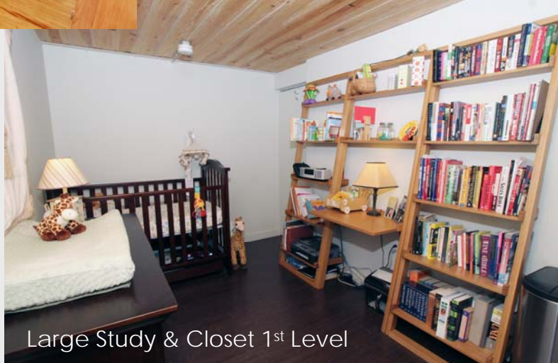
Large Study & Closet 1 st Level