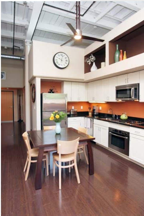
Custom Ceiling Fan & Light