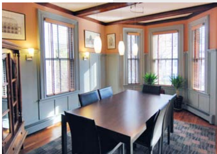
Exposed Beams, Plate Rail