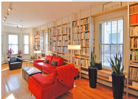
Front to Back Living Room