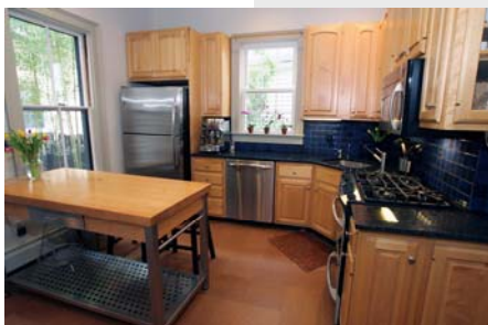
GE Profile SS Appliances, Cork Floor