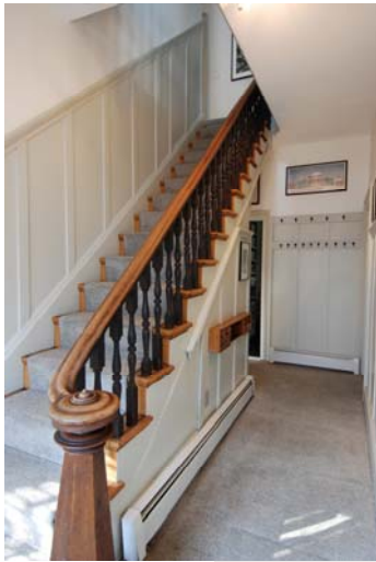
Classic Victorian Foyer