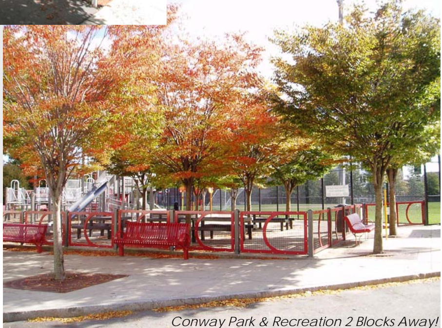
Conway Park & Recreation 2 Blocks Away!

Exclusive Listing Broker: Coldwell Banker Residential Brokerage 1730 Mass Ave, Cambridge, MA 02138 www.NewEnglandMoves.com #1 Coldwell Banker Office in New England