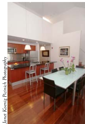
Janet Koenig Picinich Photography

Loft-style penthouse Condo with contemporary sophistication in the heart of vibrant Union Square in historic treasure with panoramic views from the exclusive roof deck. Designed by Urbanica with 2 Bedrooms, 2 Full Bath, cherry cabinetry, mahogany floors, lighting by Philippe Starck, central a/c, in-unit laundry, elevator access and off-street deeded parking. Offered for $ 585,000